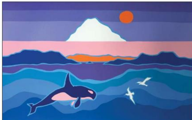
Mount Baker, Ted Harrison, 1993