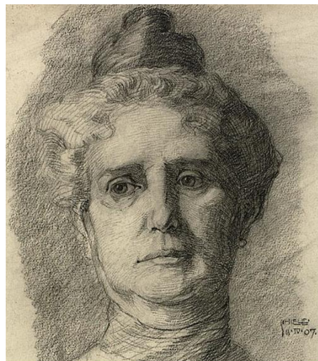
© Public Domain from The Art Institute of Chicago Egon Schiele, 1907