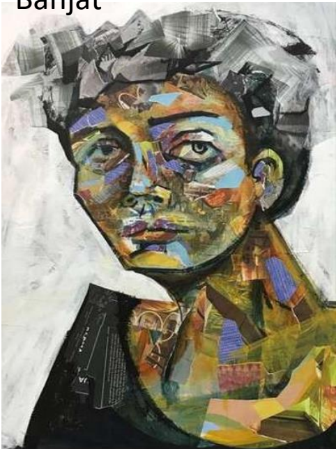
Portrait by Noor Bahjat